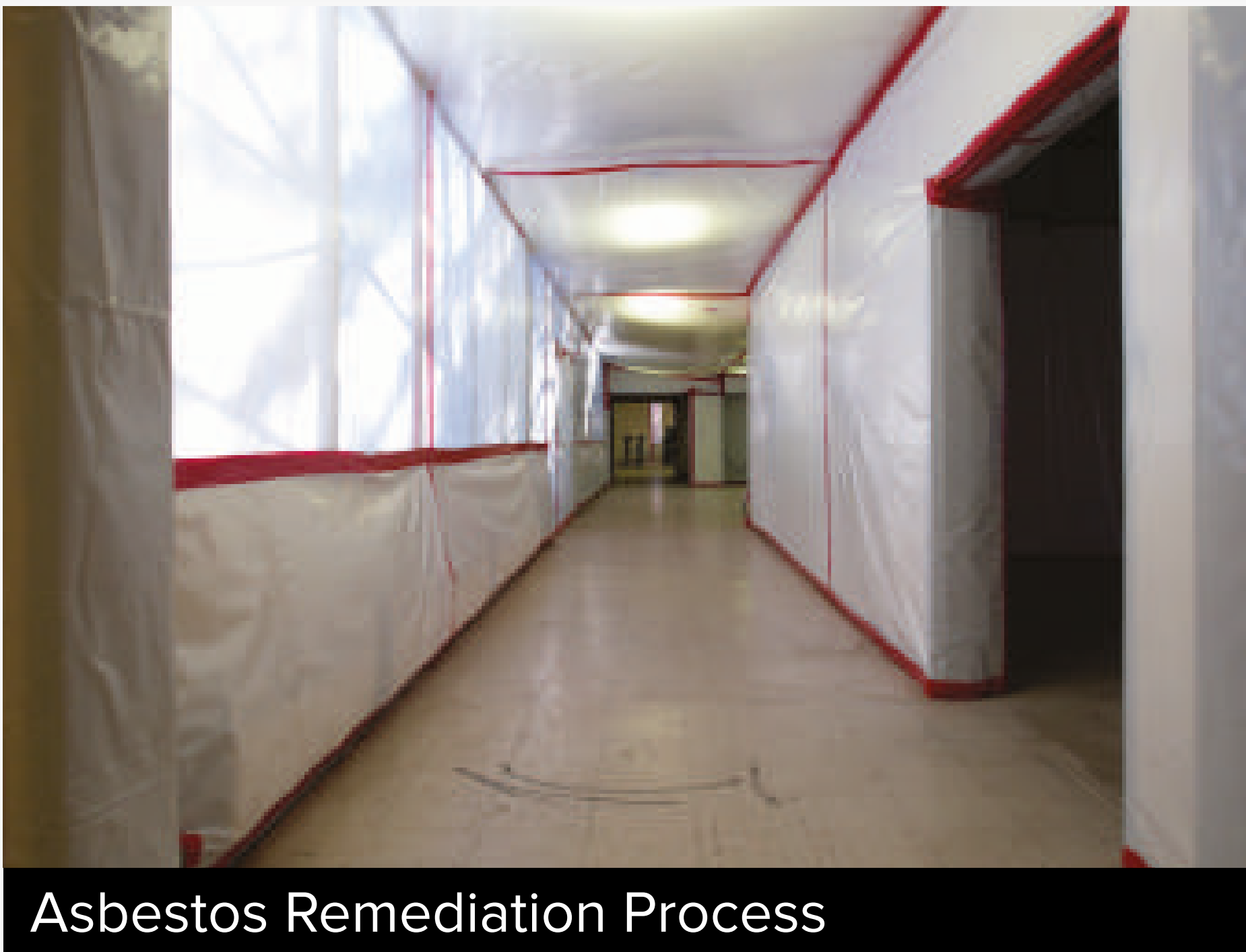
Asbestos Remediation Process