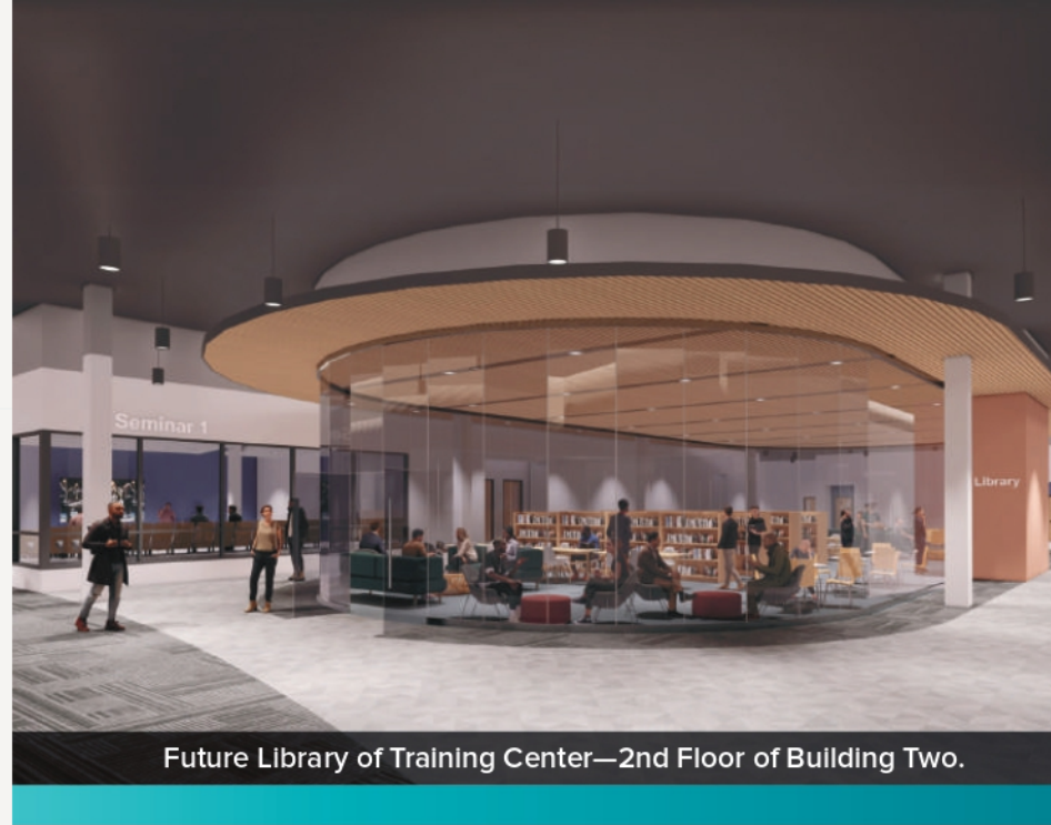
Future Library of Training Center—2nd Floor of Building Two.

This monumental milestone fills our hearts with gratitude and excitement as we embark on this transformative journey together. Thank you for your unwavering support, faith, and dedication to our shared mission.