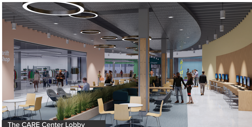
The CARE Center Lobby