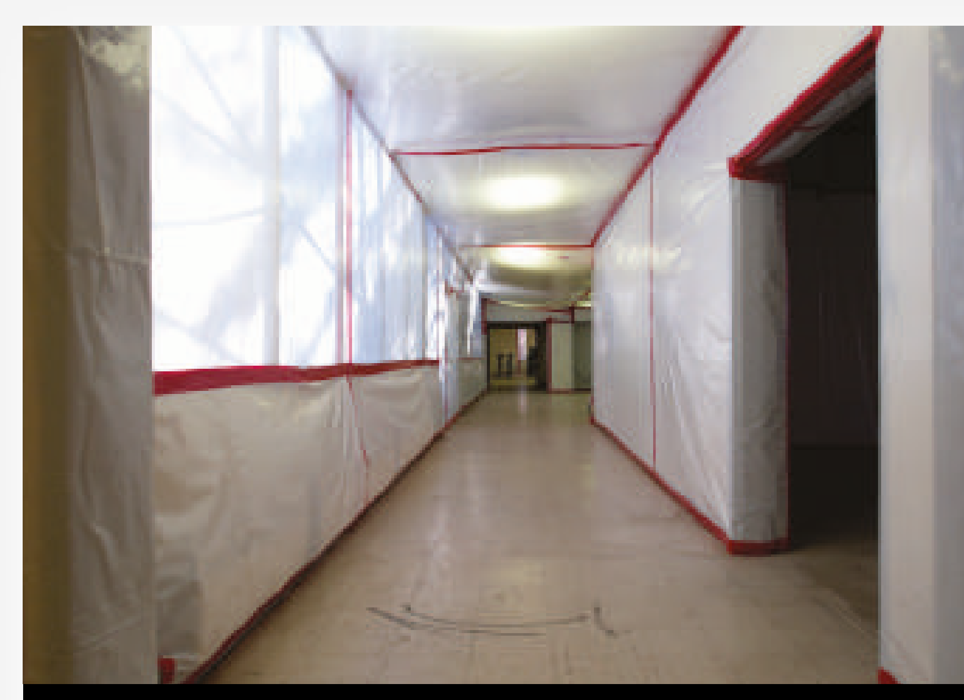
Asbestos Remediation Process